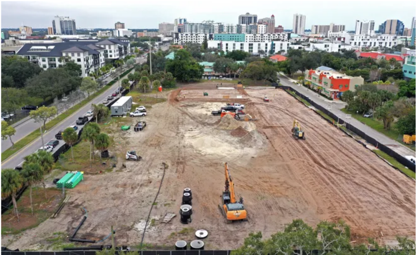
Lofts on Lemon, a $33 million project, will offer 128 housing units, including 52 aimed at "hometown heroes" such as teachers, health care workers and first responders.

SARASOTA — There may be plenty of jobs in downtown Sarasota, but when it comes to finding affordable, convenient housing for the workforce, there aren't a lot of options.